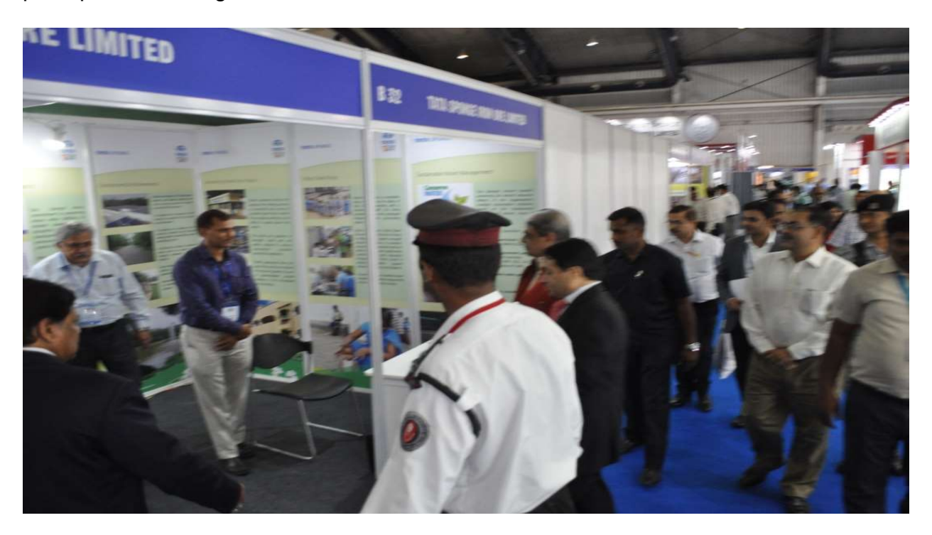
Trade Show (Exhibitors profile)

The Trade Show also had an exclusive stall on the theme of Sustainability, which provided a glimpse into the pioneering sustainability activities by mining companies all over India, especially for the stakeholders outside the mining industry. The stall had 5 leading mining companies who exhibited the exemplary work done by them in the areas of environmental protection and waste management, reclamation of mined out areas, unique socio-economic development initiatives for the surrounding communities and how mining has been improving living standards for the local population, etc. The Sustainability stall was widely appreciated by all visitors and provided an effective platform to project the good work done by mining industry and improve public perception of mining.